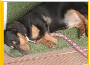
Beautiful Maggie after an exhausting training session