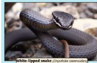
White-lipped snake ( Drysdalia coronoides )