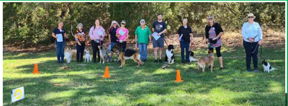
January Rally Class