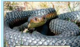
Copperhead ( Austrelaps superbus )