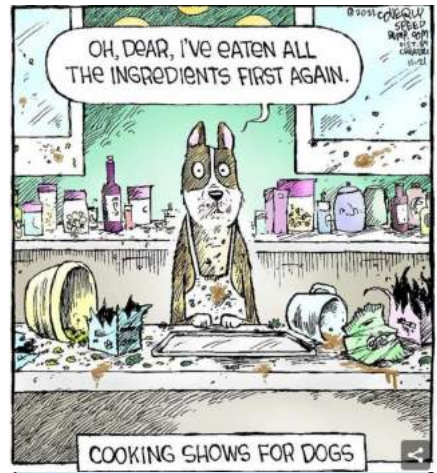
COOKING SHOWS FOR DOGS

Source: adapted from: The Tufts Animal Care and Condition (TACC) scales