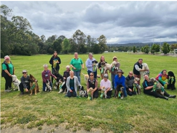
Some of our Title Achievers